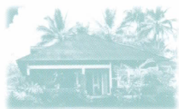
Halehuki circa 1940

American Cancer Society 1-800-227-2345 www.cancer.org